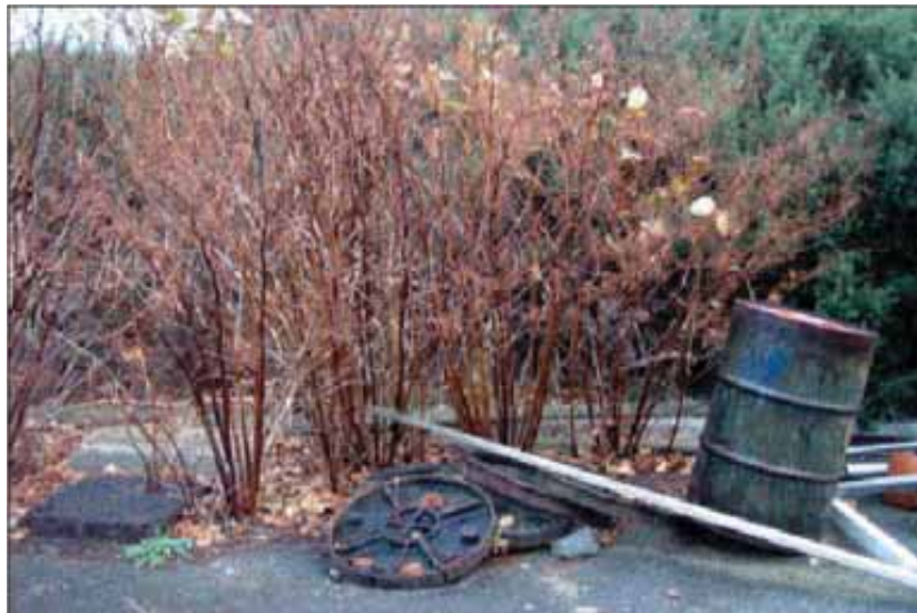
Japanese knotweed (Fallopia japonica) is a highly invasive plant introduced to Britain in the mid Nineteenth Century. It is extremely difficult to remove and costs the development industry millions of pounds per annum.