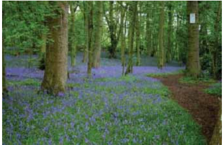
Research, such as the genetic research on the threat to native bluebells ( Hyacinthoides non-scripta ) from the Spanish bluebell ( Hyacinthoides hispanica ), is vital for informing both policy and practice on non-native species.

11.2 Research is a key area in relation to invasive non-native species. It is vital that we underpin policy with a strong evidence base and research outcomes will often be a key component helping to inform risk assessment, surveillance, detection, monitoring, control and eradication strategies. Applied research is particularly important to help inform and refine control methods as well as for assessing the feasibility of proposed action (for example, eradication attempts). Feasibility studies, often involving modelling, are a key tool for assessing the likely costs and probability of success for larger-scale control or eradication efforts.