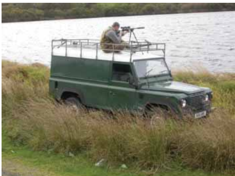
The Defra and EU LIFE funded Ruddy Duck eradication project is the largest project of its kind in Europe.