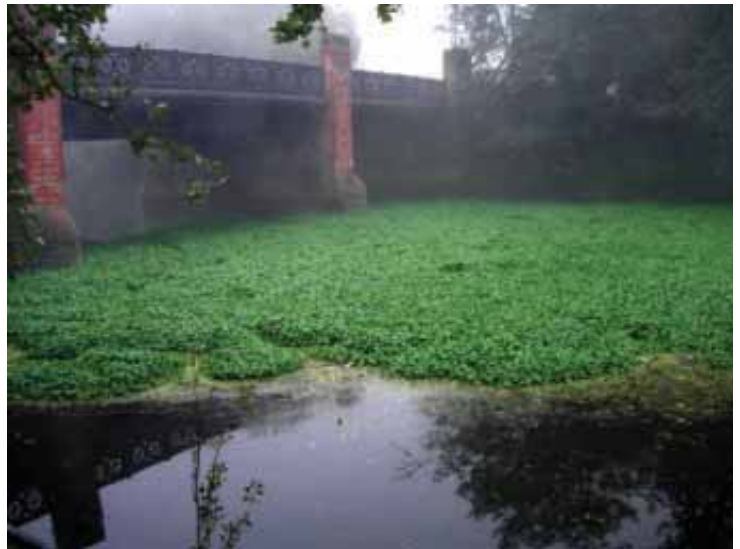
Banning the sale of highly invasive species such as floating pennywort is possible under existing legislation.

10.2 Some useful and very specific measures were taken in the Nature Conservation (Scotland) Act 2004 and the Natural Environment and Rural Communities (NERC) Act 2006 , but there is still a need to create a better sense of cohesion across existing powers and a need for further improvements. The current arrangements whereby many powers are available for very specific purposes no longer serve us well in adopting a more comprehensive and co-ordinated approach to addressing invasive non-native species issues. For example, there may be scope for broadening the remit of the Plant Health Services to operate more widely outside the traditional concerns of threats to agriculture and horticulture from plant pests and diseases. This would reap the benefits of an existing infrastructure and national network.