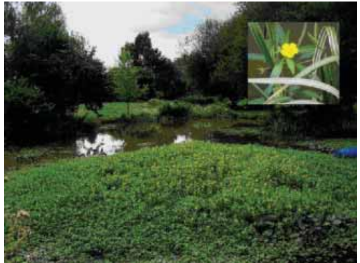
The water primrose (Ludwigia peploides/grandiflora) is a South American species that has become highly invasive in France. There is currently research being carried out in Britain to see how best we can eradicate the few wild populations here before it becomes a serious problem.