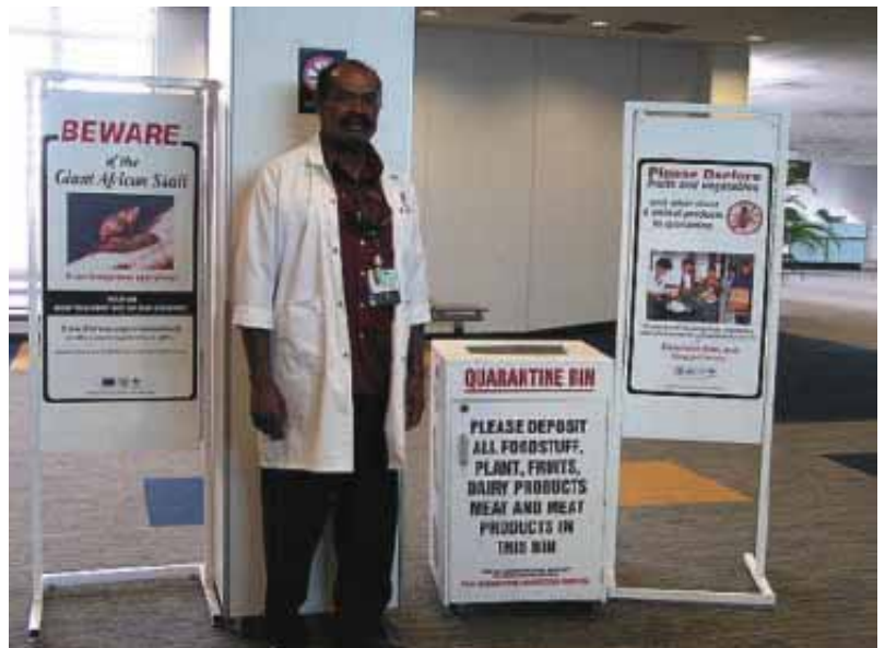
Discouraging travellers from bringing unwanted products into the country can be an efficient and cost-effective way of preventing invasive species entering the country.